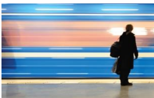
AN IGNATIAN PRAYER ADVENTURE

Ignite 6:8 Prayer Walk: Mondays 11.30am - 12.30pm. No walk Monday 27 th January due to anniversary day..